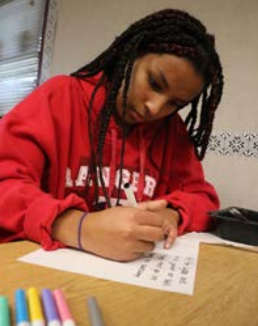
11th graders working on letters for Everlasting Envelopes recipients