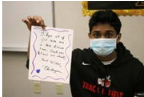
Students with some of the letters and cards created for shut-in seniors at Royal Park Retirement