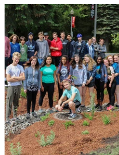
Cover Photo: 8th graders stand in the storm garden they created in front of the Middle School.