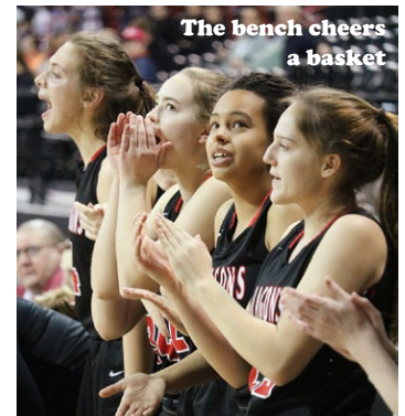
The bench cheers a basket