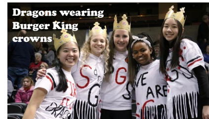
Dragons wearing Burger King crowns