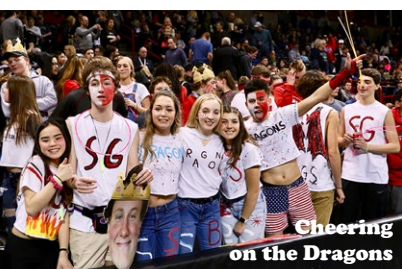
Cheering on the Dragons