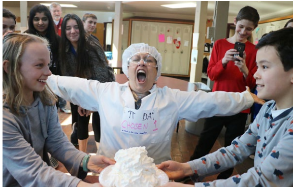
Clockwise from upper left: