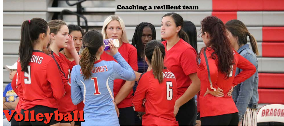
Coaching a resilient team

To say that this year of volleyball was challenging would be an understatement. The SGS volleyball team went 0-13 on the season. It was a year that no coach, or player, hopes to experience. Regardless of lack of wins, each and every player fought day in and day out to get better. It didn't matter what the score was, we were having fun and getting better! As a coach, I couldn't be any more thankful and proud of the group of girls that we had.