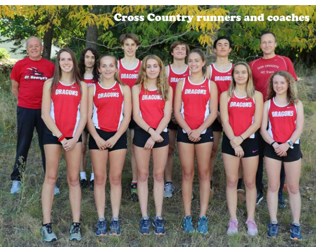
Cross Country runners and coaches