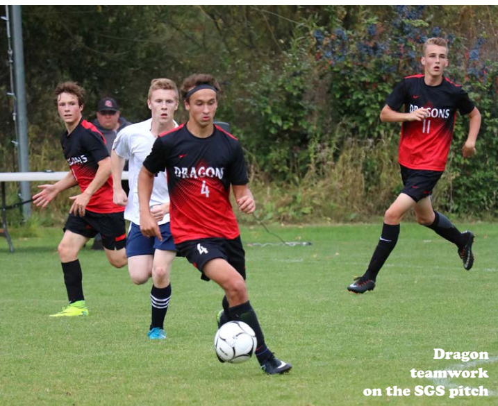
Dragon teamwork on the SGS pitch

some growing pains, but we also had some pretty amazing moments, both on the soccer field and off the field as a soccer family. One of my favorite memories was when we took our epic road trip in the yellow school bus to play in