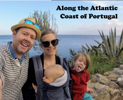
Along the Atlantic Coast of Portugal