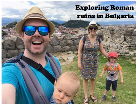
Exploring Roman ruins in Bulgaria