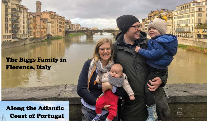
The Biggs Family in Florence, Italy